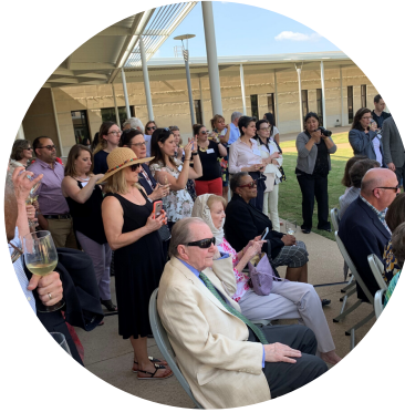
CCF Garden Party, May 2019