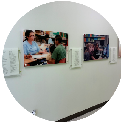
New CCF Donor Wall, May 2019