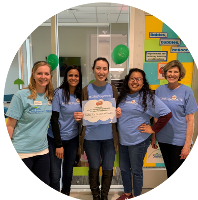
Comets Giving Day, April 2019